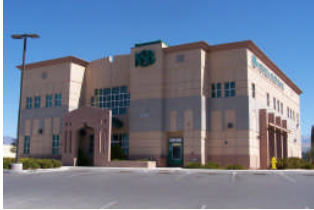
EDEN Office located at 1301 S. Hwy 160 (2nd floor) Pahrump, NV 89048

At the Nye County Commission meeting of April 17, 2007 the Board of County Commissioners unanimously approved the agreement naming EDEN, Inc. as the economic development authority for Nye County. This was a necessary measure to ensure that we remain in good standing to apply for our annual grant from the Nevada Commission on Economic Development (NCED). The agreement outlines the scope of work which EDEN, Inc. is willing to undertake on behalf of the county and its communities.