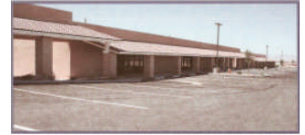
Beverly Plaza Retail Center is just one of the properties listed on our website.

ing to locate here. It can be empty land or an industrial/business park. We would like to know the location of the property, how the property is zoned, if utilities are available or existing, and if the roads are improved. As always, pictures are helpful. Visit our website to see what we've done with the information we've compiled so far. If you know of any property that meets this criteria, call us at (775)751-1923 or email us at carlay@eden-nv.com.