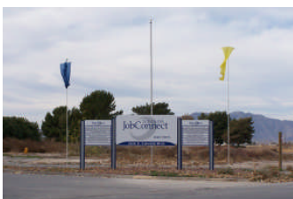
Nevada JobConnect 2101 E. Calvada Blvd. Pahrump, NV 89048 (775) 537-2323 or (888) 787-2568 www.nevadajobconnect.com

JobConnect will help new or existing businesses with recruitment, business incentives, training resources, as well as in obtaining labor market and economic information. They have online resources available at www.nevadajobconnect.com . They will help the jobseeker with the tools and resources necessary to obtain and retain a job. They have Nevada's largest database of job openings and will help the jobseeker with resumé preparation, interviewing techniques, and career and skills assessment. JobConnect is a complete resource center with a large network of partners at your disposal.